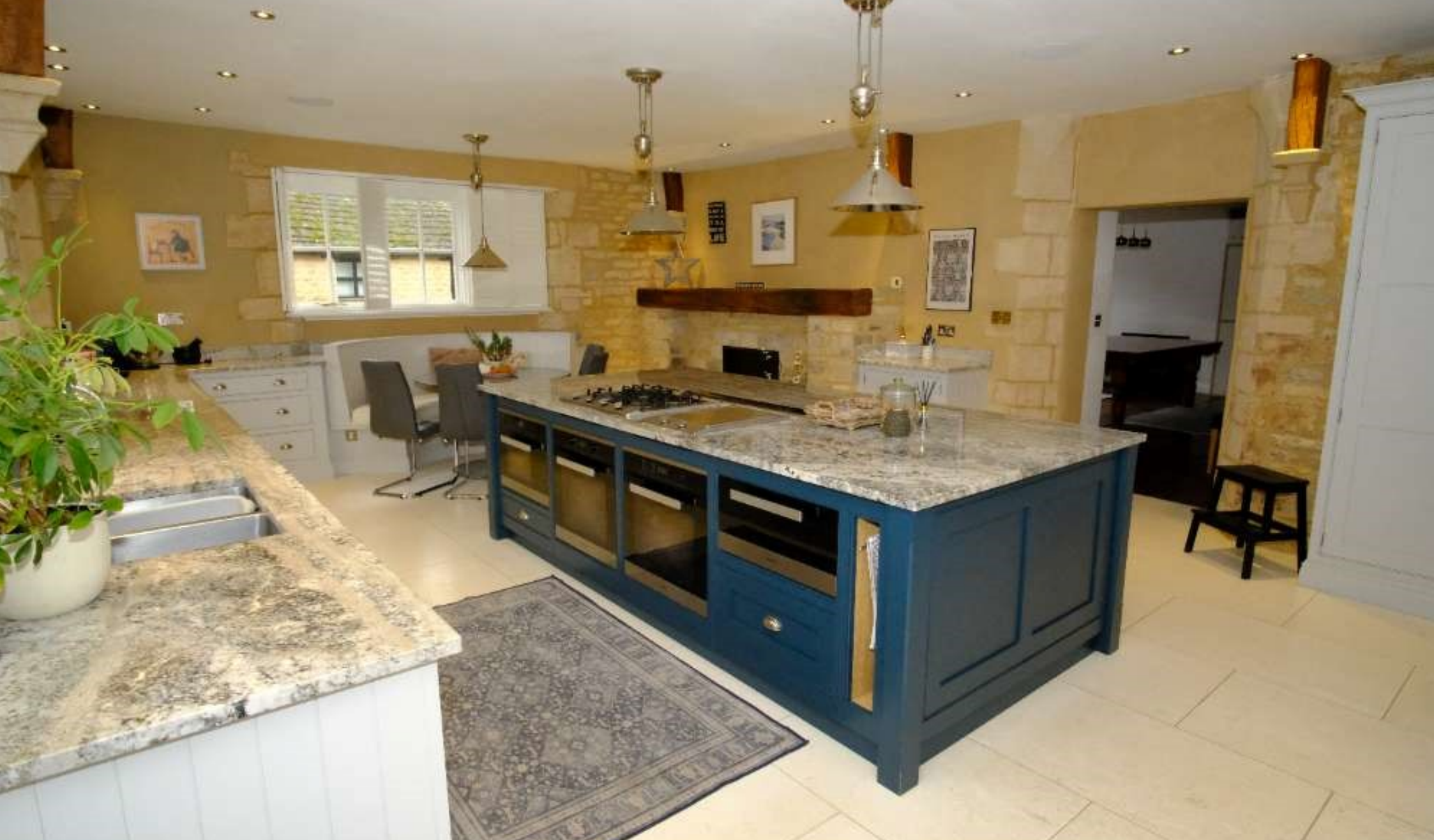
THE OLD SCHOOL GEDDINGTON, NORTHANTS